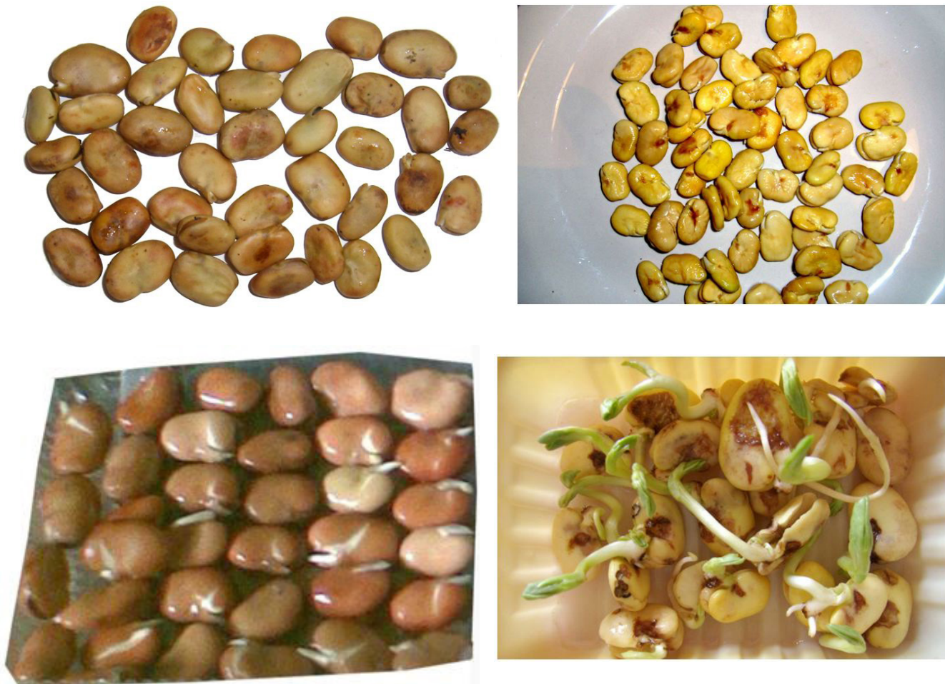
Figure 2: External appearance of the seeds of broad beans before and after germination depending on method of reproduction of the raw material (A) natural seeds; (B) Peeled seeds; (C) Germinated by traditional way

It should be noticed, that in the process of germination of peeled bean samples by suggested method, they produce double sprouts. However, at natural unpeeled samples it is hardly in evidence, in other words they possess single sprouts. Besides, the process of germination happens much more slowly in comparison to traditional way of germination.