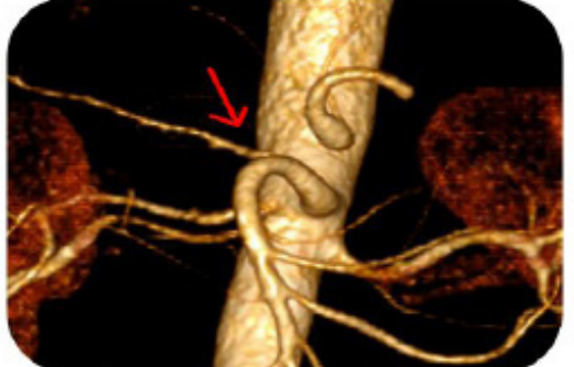
B. Common hepatic artery arising from the superior mesenteric artery