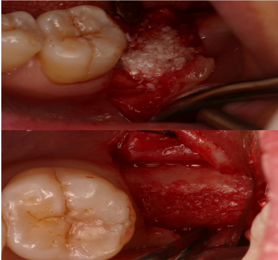
Figure 2: Clinical figures of GBR procedure.

#37 area received GBR procedure and re-opening for implant.