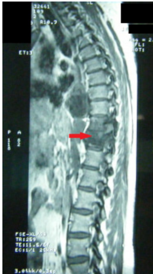
Figure 2: MRI Sagittal section objectifying multicystic formations and pre latero-vertebral extent of the 7 th vertebra

The patient underwent surgery to excise the cysts and had a laminectomy performed through the posterior approach for neurologic decompression at the level of spinal involvement (D7-L2). Care was taken to prevent rupture while removing the cysts. Multiple vesicles were found and easily dissected with total resection from the cord. All the cysts were removed. The operation area was soaked with 3% normal saline. The surrounding surgical field was packed with mops and iliac autogenous bone grafting was used for reconstruction. Histopathological examination confirmed the diagnosis of hydatid cyst. Antihelminthic therapy with 400 mg of albendazole 3 times daily was prescribed for 6 months then followed by low dose for 6 months of maintenance. Radiological evaluation showed no evidence of disease recurrence. Postoperative neurological rehabilitation was performed for 6 months. Patient had normal neurologic status at the last follow-up of one year. At the end of the treatment (1 year), hydatid serology and blood Eosinophilia were normal.