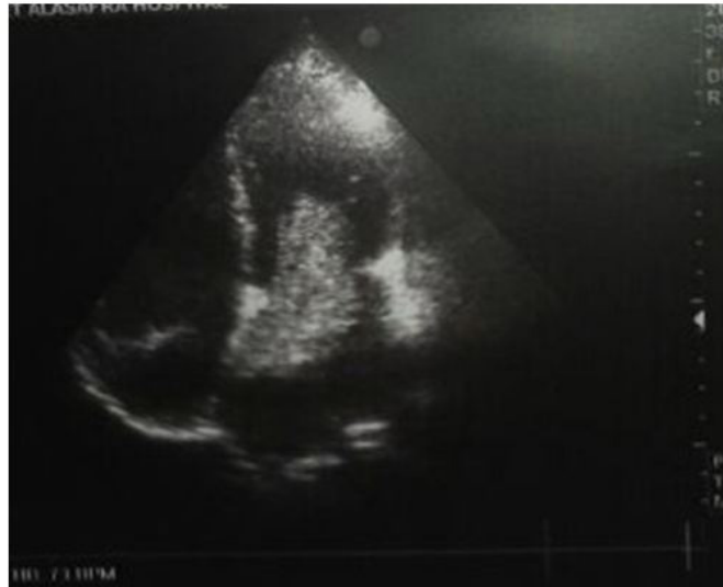
Figure 1: Echocardiogram showing large oval left atrial myxoma attached to fossa ovalis and projecting into left ventricle

Past medical history of the patient showed a recently discovered large left atrial myxoma that presented with cough, palpitation and chest tightness one month before the onset of stroke and the patient was assigned for surgical excision unfortunately the same day the stroke occurred. Her Echocardiogram showed a large (8 x 6 x 7 cm) left atrial mass with areas of degeneration and mildly impairing flow through mitral valve (Figure 1). Other Echocardiogram parameters were within normal limits with no intracardiac thrombi and EF was 65%. She had no history of previous TIAs.