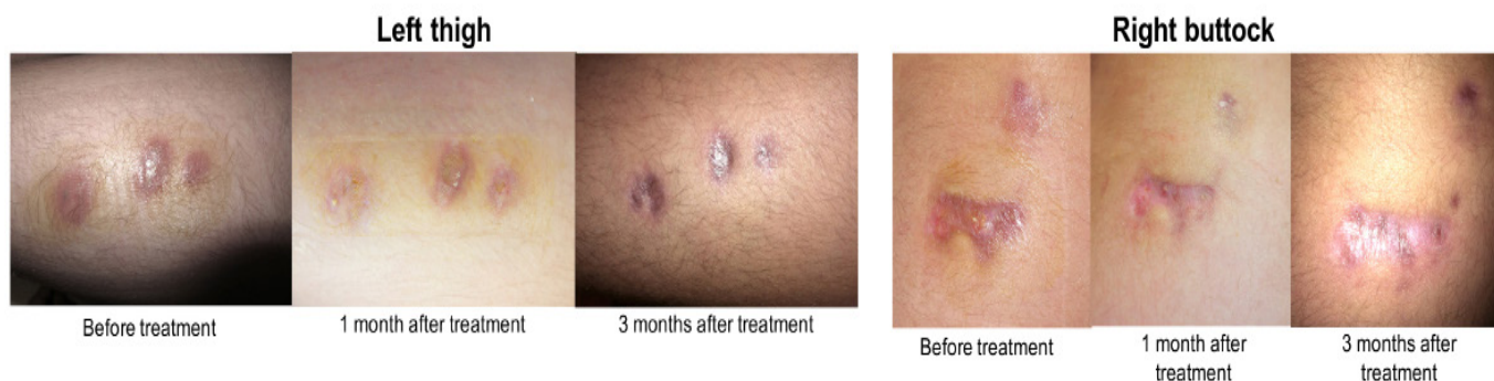
Figure 1: Lesions appeared on both thighs