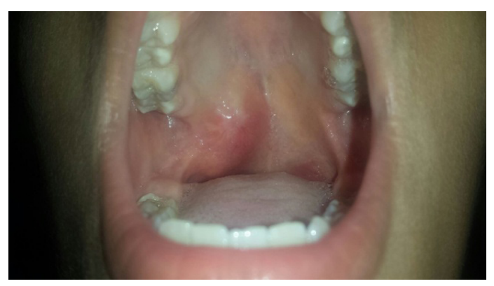
Figure 1: A single swelling on the right palatal region

On intra-oral examination, a single swelling on the right palatal region about 2 cm in size, with diffuse borders was noticed .The swelling was firm in consistency and non-tender (Figure 1). Routine hemogram and other biochemical parameters were within normal limits.