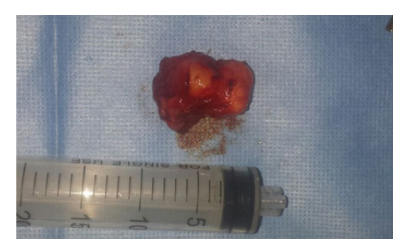
Figure 4: The postoperative appearance of the mass after resection