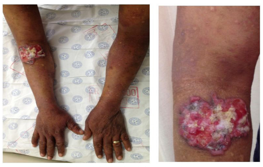
Figure 1: Ulcerated plaque on the right forearm (a) and close up view