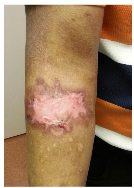
Figure 3: Right forearm, following ABVD chemotherapy