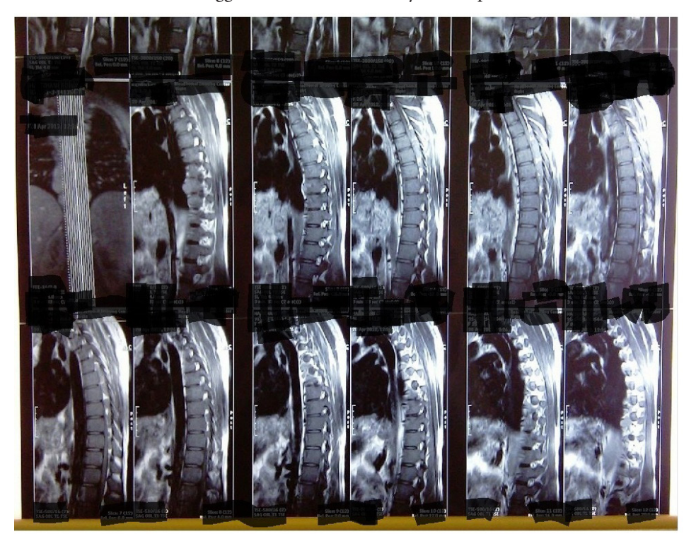
Figure 1: Saggital T1w and T2w images show a large epidural mass occupying the posterior part of the spinal canal, extending from T5 to T11 level. The mass is displacing the spinal cord anteriorly and compressing it

Magnetic resonance imaging (MRI) of his thoracolumbar spinal cord revealed multiple paravertebral masses with rib expansion, intraspinal extension and soft tissue masses, suggestive of Extramedullary hematopoiesis or neurofibromatosis (Figure 1 and 2).