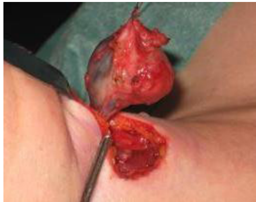
Figure 2: Resection of aneurysm with the excised mass

A decision to excise the swelling was made. Under general anesthesia, adhesion to the surrounding tissues was freed and the mass was excised after ligating the proximal and distal ends of the external jugular vein (Figure 2).