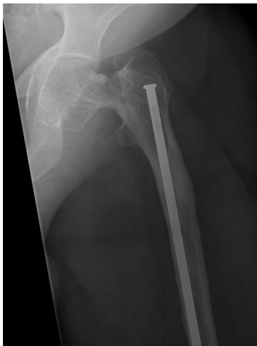
Figure 1: AP radiograph Left hip taken at initial presentation to our institution with femoral neck fracture and incomplete AFF in the presence of previously placed growing femoral rods

left lower extremity for 6 weeks was elected for treatment. After 6 weeks, he sustained a muscle spasm while lying in bed, resulting in immediate pain in his left hip. Radiographs demonstrated a displaced femoral neck fracture as well as a proximal femur stress fracture in the presence of IM growing rods (Figure 1). He was subsequently transferred to our institution for further management. Home medications upon arrival include alendronate 35 mg once weekly.