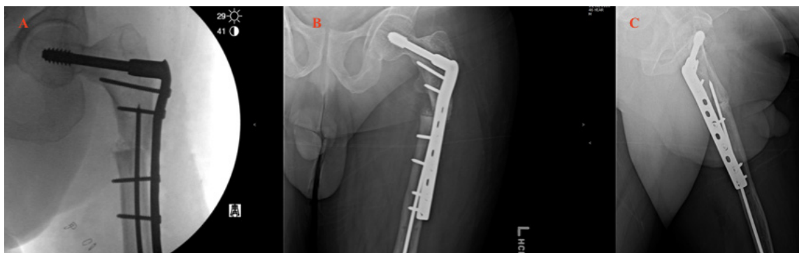
Figure 3: (a) intra-op radiographs osteotomy of fracture site, removal of deep hardware in femoral neck, and removal of proximal aspect of growing rod; (b-c) AP and lateral radiographs at first follow up

At one-year postoperatively, he continued to have minor residual left hip pain and low back pain. He was able to return to his activity of choice, bowling, but with significant start-up pain. At last follow up, he was ambulating unassisted and balance is without issue. Radiographs demonstrate healing at the osteotomy site with DCS in an unchanged position (Figure 4a and b).