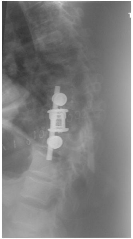
Figure 6: Post-operative thoracic spine lateral X-ray; Demonstrating cage and lateral plate reconstruction post T12 corpectomy