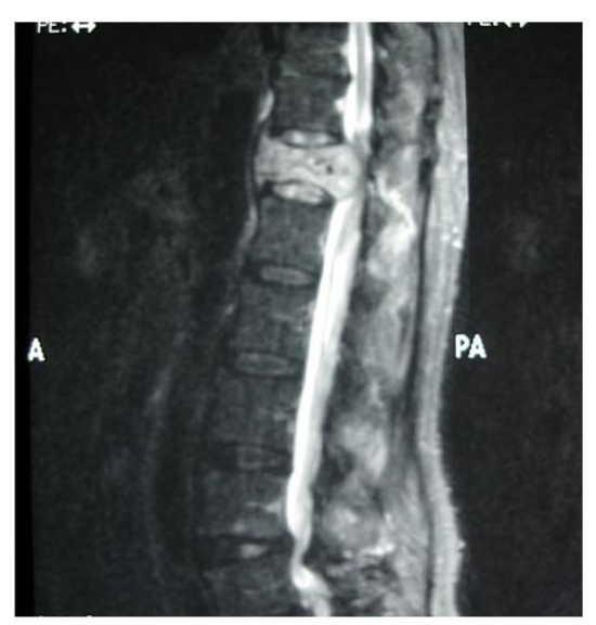
Figure 3: Pre-operative T2 sagittal MRI; Demonstrating collapse of T12 vertebral body with significant cord compression