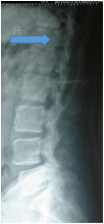
Figure 1: Pre-operative lateral lumbar spine X-ray lumbar; Demonstrating osteolysis of T12