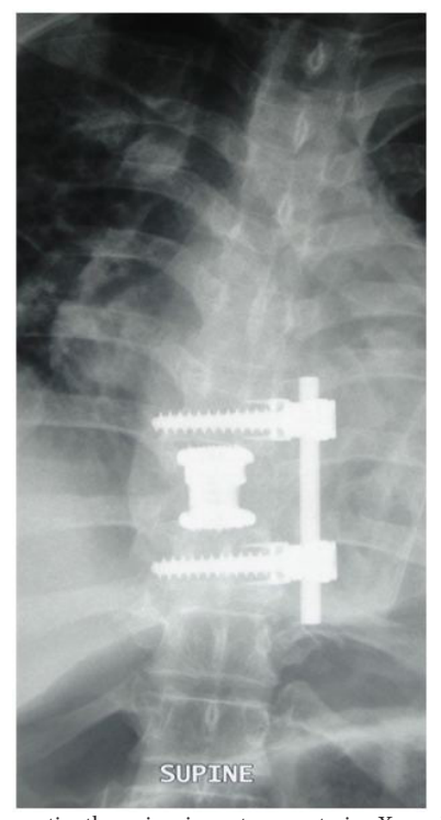
Figure 5: Post-operative thoracic spine antero-posterior X-ray; Demonstrating cage and lateral plate reconstruction post T12 corpectomy