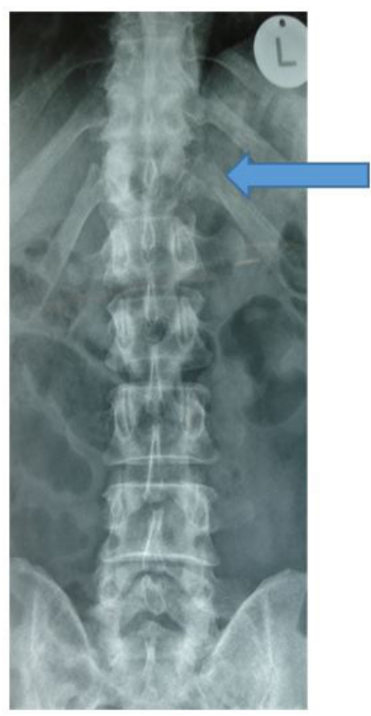
Figure 2: Pre-operative antero-posterior spine X-ray; Demonstrating osteolysis of pedicle of T12