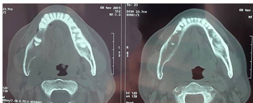
Figure 2: CT scan showing an infiltration of the right mandible