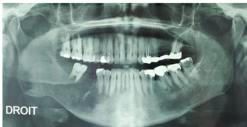
Figure 1: Panoramic X-ray showing osteolysis of the right mandible