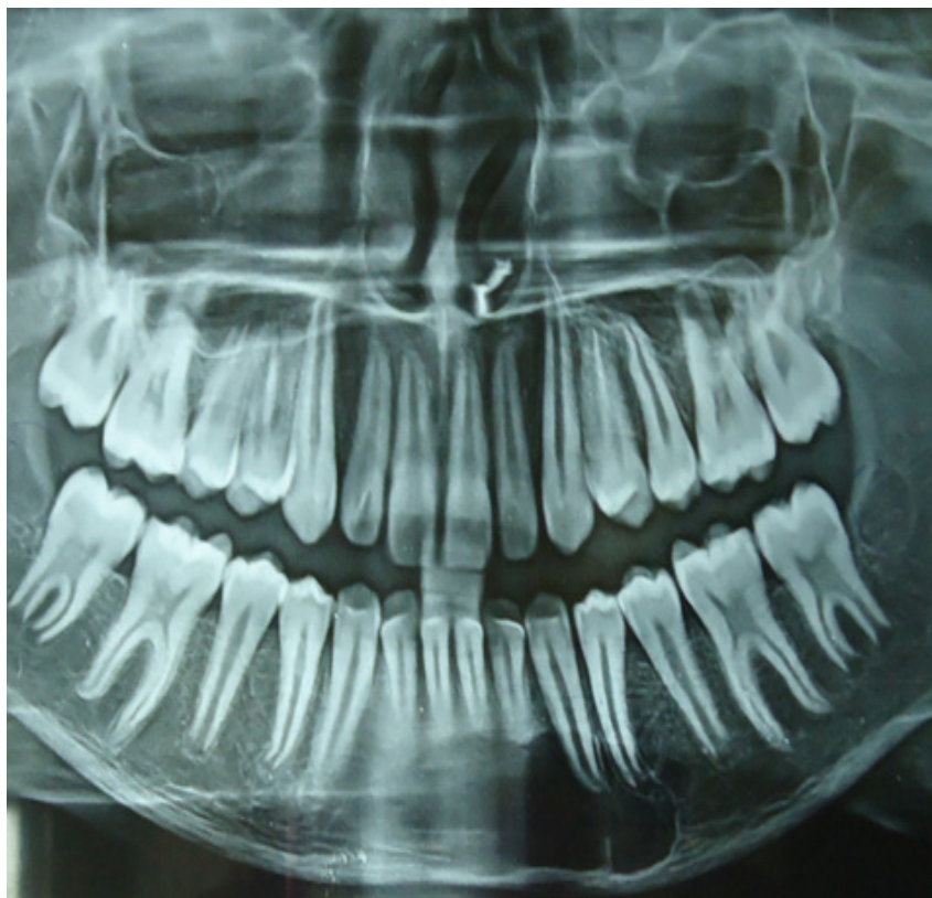
Figure 1: Pre- operative panoramic view showing a well defined unilocular radiolucency in the anterior of mandible extending from right lateral incisor to left first premolar and extending to the lower border, with well-defined, smooth, corticated margins with no bony expansion.