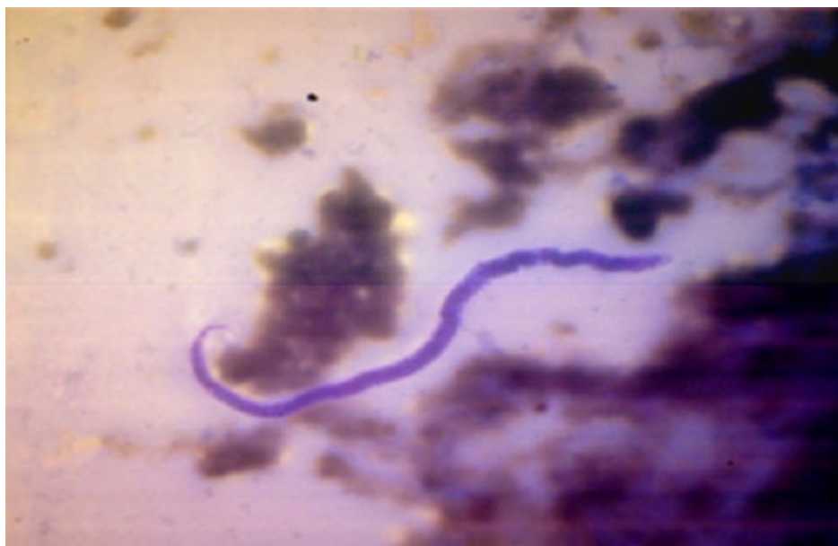
Figure1: Bone marrow aspirate showing microfilaria

Investigations showed hemoglobin 9 g%, total count 1200/ \mu l differential count P40L40, MCV 77.3fl, platelet count 65000/ \mu l. His liver, renal function tests, serum electrolytes, blood sugar were within normal limits. Initially a possibility of malaria was considered and patient was started on chloroquine and primaquine without any response as fever persisted. Peripheral smear for malaria parasites was repeatedly negative. Artesunate and Doxycycline was added considering falciparum malaria, but fever was persisting. Meanwhile his total count dropped to 700/ \mu l and hemoglobin dropped to 6.5 g%. Suspecting underlying bone marrow failure, bone marrow aspirate was done which showed microfilaria (Figure -1,2) and the cellularity was decreased, reported as ? hypoplastic.