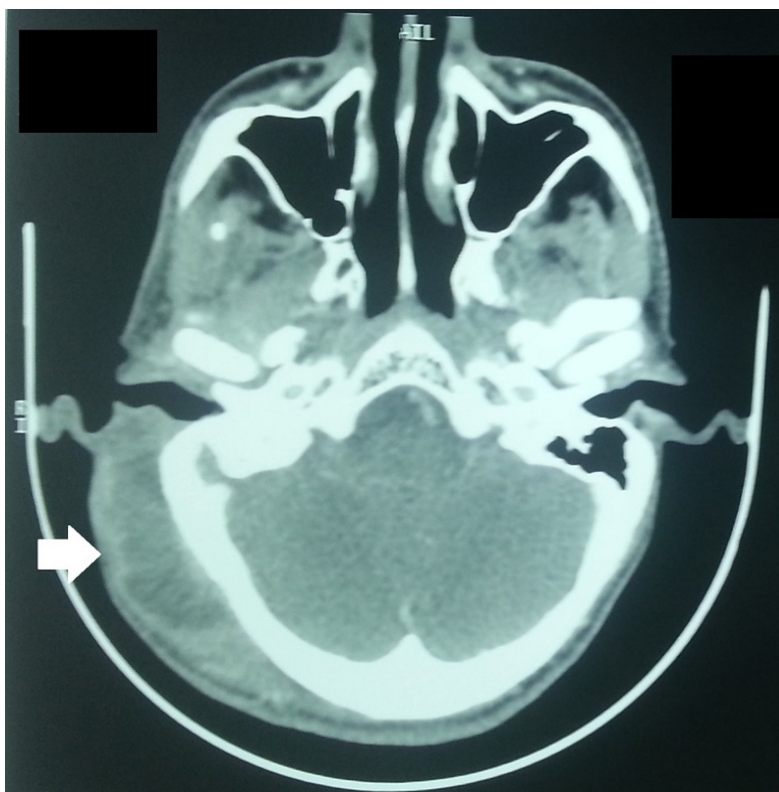
Figure 1: Axial CT revealed a huge subperiosteal abscess in the right postauricular area

rovement of consciousness. Otologic surgery (right mastoidectomy) was planned 15 days, after the neurosurgical drainage. The mastoid cavity and middle ear were filled with granulation and epithelial desquamation. Furthermore, the ossicles were missing. We removed the cholesteatoma in the mastoid cavity and the tegmental area. There were no bony defects of the facial nerve canal or the semi-circular canal.