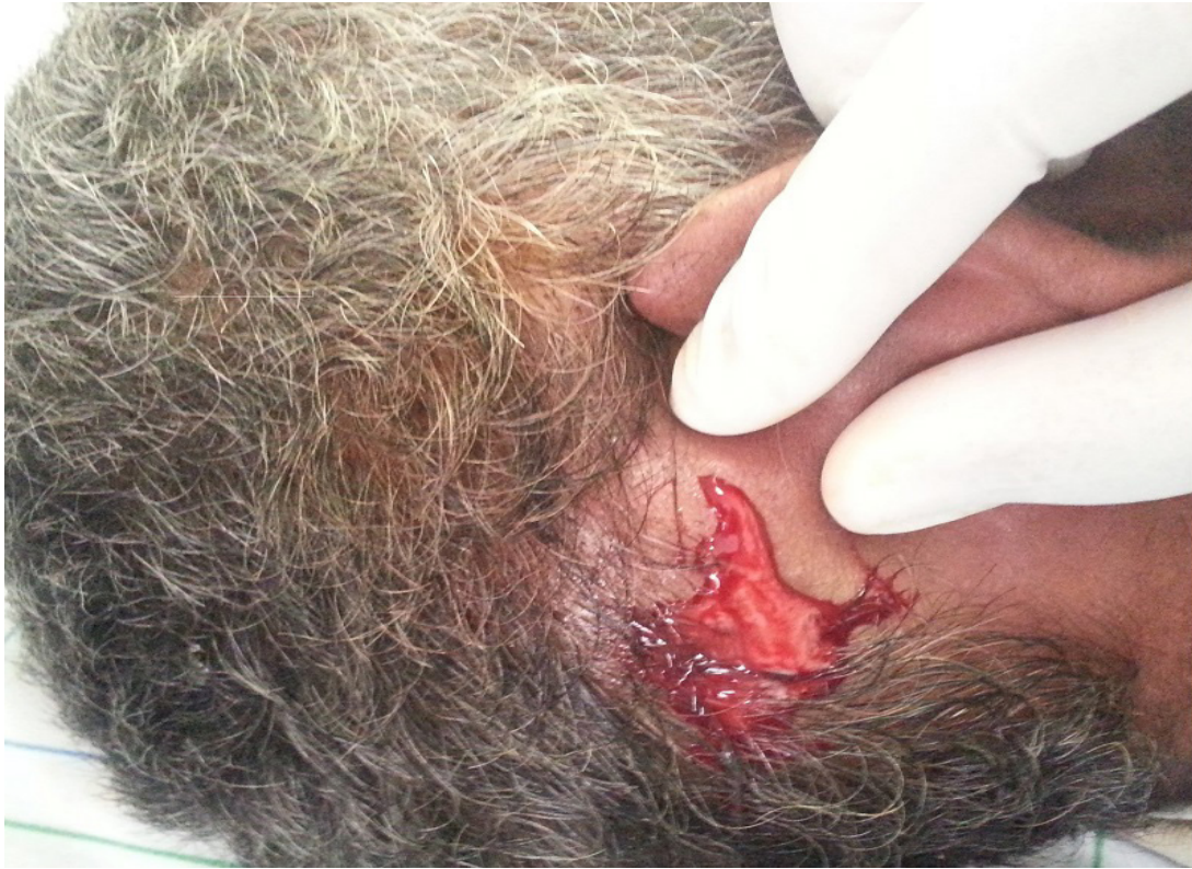
Figure 3: Drainage of mastoiditis under local anesthesia

Post-operative period was uneventful. After mastoidectomy, intravenous antibiotic therapy was maintained for 4 weeks. The right extra axial collection had disappeared on cerebral CT scan (Figure 4) one month after the neurosurgical drainage. He has been under observation as an outpatient for 1 year already and has presented no abnormal signs.