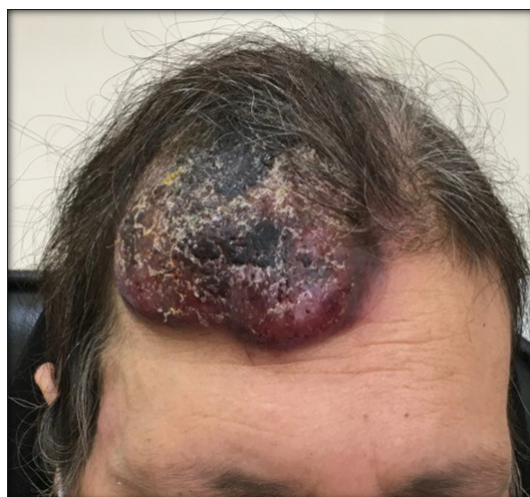
Figure 1: Large plum colored well defined tumor on forehead of patient, with hemorrhagic crusting on surface