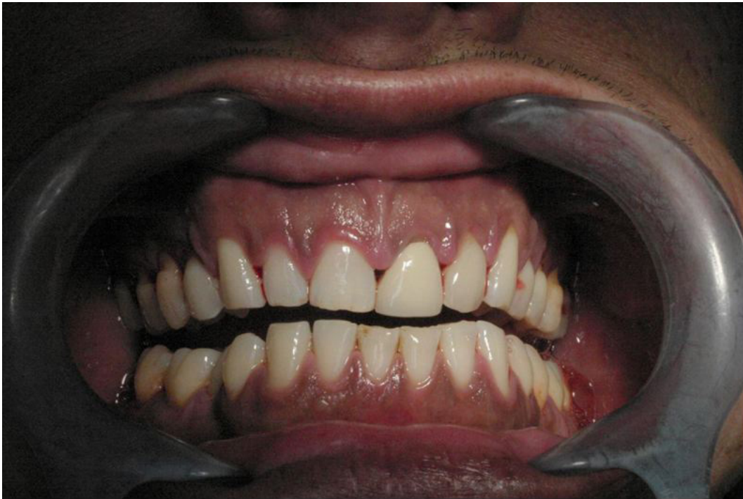
Figure 1: Discoloured oral soft tissues after professional removal of food residues and oral biofilm