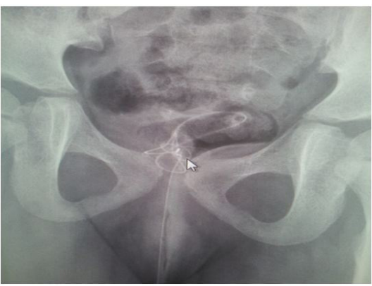
Figure 1: Radiograph showing the knotted catheter in the bladder (Arrow: the knot).

At the end of the procedure control cystoscopy was performed to evaluate the urethra and bladder mucosa which was found to be normal and a foley catheter was inserted into the bladder for urinary drainage. The child made a good post-operative recovery and was discharged home well the following day.