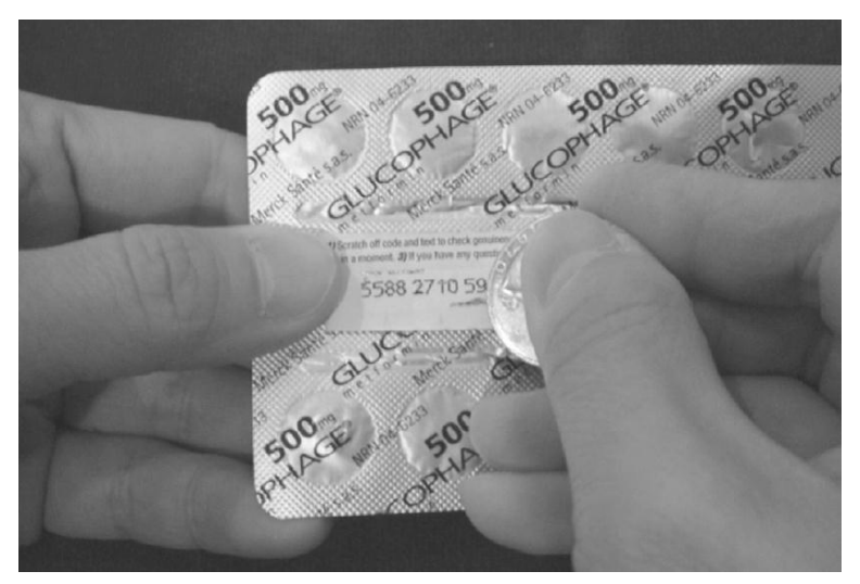
Figure 3: Picture of Sproxil technology Used in the Nigerian Anti-Counterfeit Initiative [17]

Serialized codes are a process that enables consumers to immediately authenticate product through a component or code, on devices or systems that are already in commercial use. Serial codes were implemented in 2010 through labels that have a "scratch-off" feature revealing a code that consumers can check to authenticate the product [17]. The suppliers pay for and apply the labels. This action specifically uses Sproxil Incorporated technology (Figure 3). The tester, usually the consumer at the point-of-purchase, scratches off the label to reveal a code, and then submits it for authentication through a mobile phone text message. The consumer receives an immediate positive "OK" or negative "Fake – Don't Use" statement [17]. This is similar to the M-Pedigree program in Ghana [72] and to systems that are already implemented in 2010 by Nigerian companies such as BioFem (Mobile Anti-counterfeit System-MAS) [73]. The chain of custody or pedigree of the product is not, however, identified by the system. The serial number is one more piece of evidence that a product is authentic.