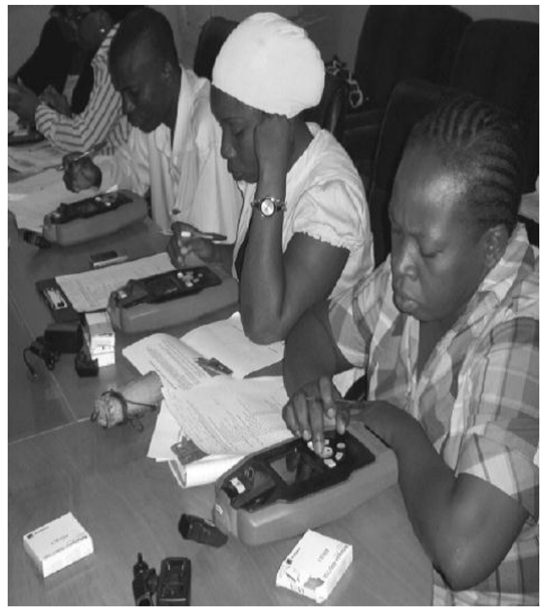
Figure 2: Thermo Scientific Incorporated Truscan™ handheld Raman Spectroscopy equipment (in use by NAFDAC counterfeit medicine inspectors) [17]

Product Authentication is a process for law enforcement or investigators to test product authenticity in-the-field, simultaneously from many locations, and with an immediate assessment of "authentic" or "suspicious." A field trial of the Thermo Scientific Incorporated Truscan™ handheld Raman Spectroscopy equipment was conducted in December 2009 and the system was implemented February 2010 (Figure 2). A tablet can be inserted into the port of this device to authenticate the product itself, rather than the product's packaging. It also has an attachment that can scan through clear packaging to the product. A chemical profile of the suspect product is created and compared with a pre-loaded genuine product profile to confirm authenticity.