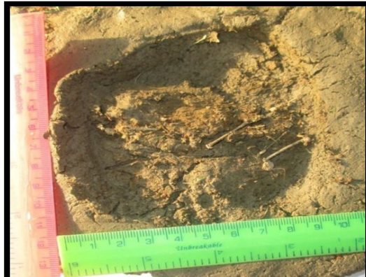
Figure 20: Pugmark of horse (hind foot)