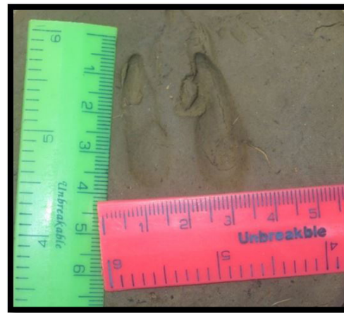
Figure 8: Pugmark of deer (hind foot)