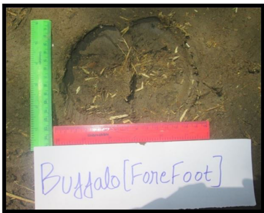
Figure 13: Pugmark of buffalo (fore foot)