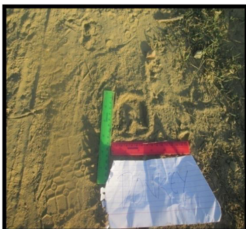
Figure 27: Pugmark of donkey (fore foot)