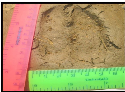
Figure 11: Pugmark of goat (fore foot)