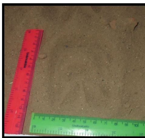
Figure 28: Pugmark of donkey (hind foot)