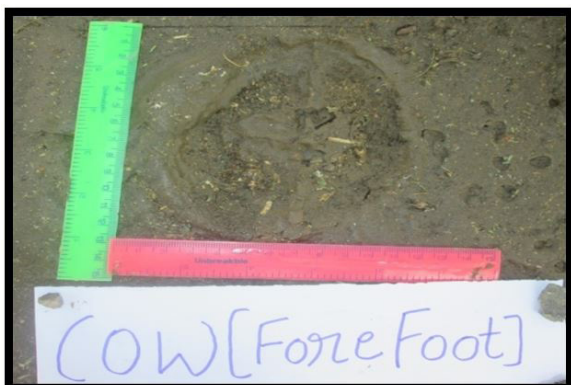
Figure 3: Pugmark of cow (fore foot)