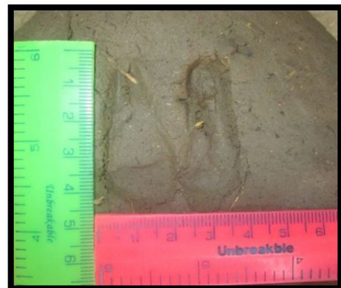
Figure 12: Pugmark of goat (hind foot)