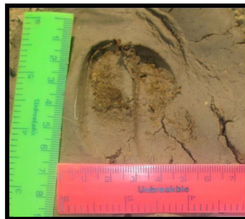
Figure 10: Pugmark of sheep (hind foot)