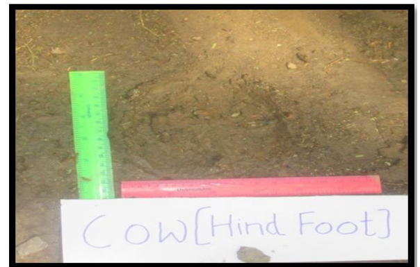
Figure 4: Pugmark of cow (hind foot)