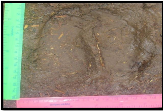
Figure 5: Pugmark of bull (fore foot)