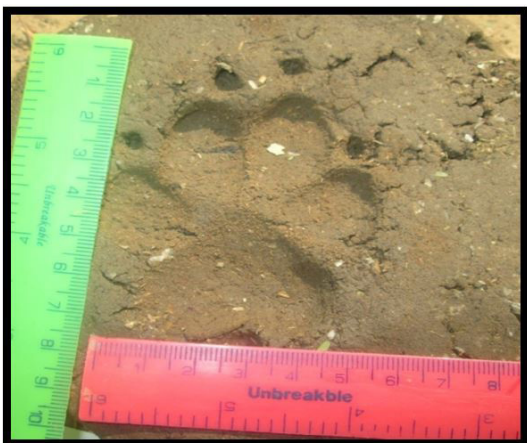
Figure 15: Pugmark of dog (fore foot)