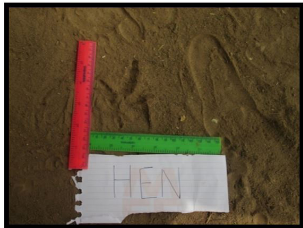
Figure 2: Pugmark of hen