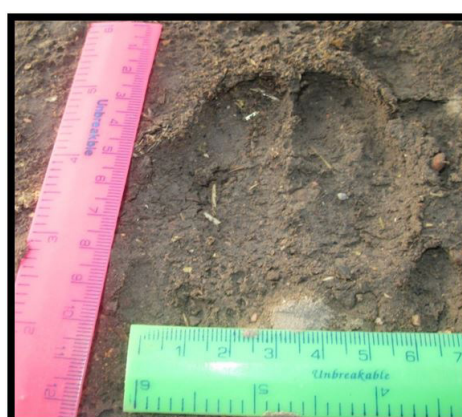
Figure 24: Pugmark of pig (hind foot)