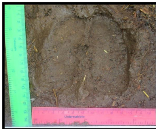
Figure 14: Pugmark of bull (hind foot)