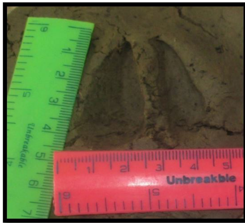
Figure 7: Pugmark of deer (fore foot)