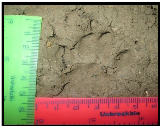
Figure 17: Pugmark of cat (fore foot)