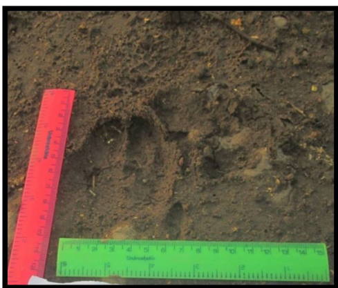
Figure 23: Pugmark of pig (fore foot)