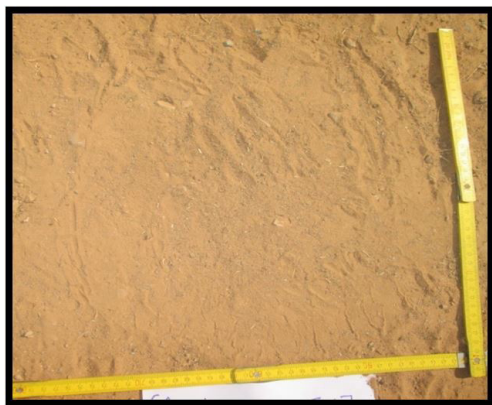
Figure 21: Pugmark of elephant (fore foot)