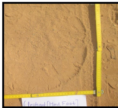
Figure 22: Pugmark of elephant (hind foot)