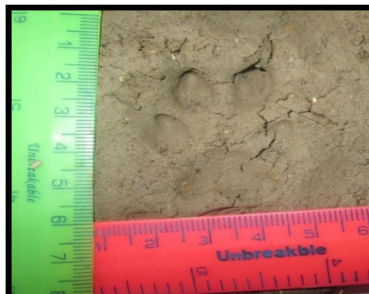
Figure 18: Pugmark of cat (hind foot)