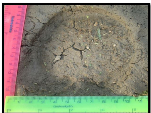
Figure 19: Pugmark of horse (fore foot)