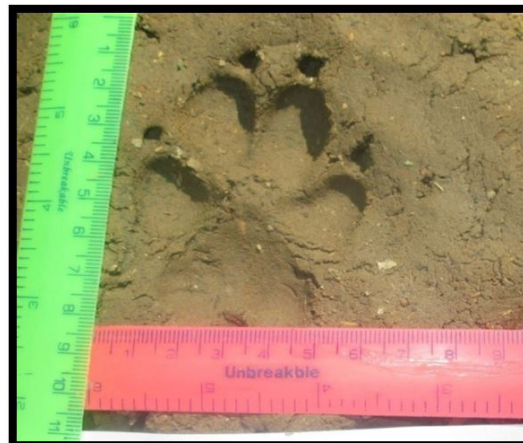
Figure 16: Pugmark of dog (hind foot)