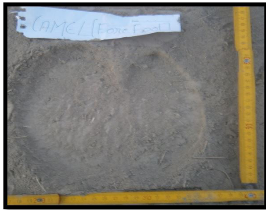
Figure 29: Pugmark of camel (fore foot)