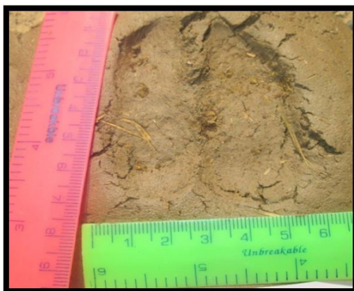
Figure 9: Pugmark of sheep (fore foot)