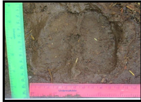
Figure 6: Pugmark of bull (hind foot)