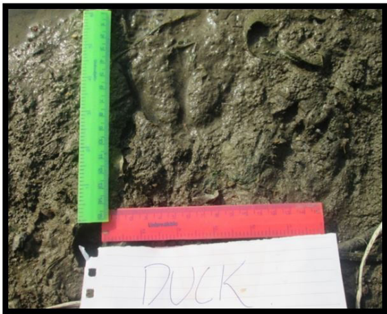
Figure 1: Pugmark of duck

After observing all samples of pugmark of different animal's species, following results were obtained (Figures 1 to 30).