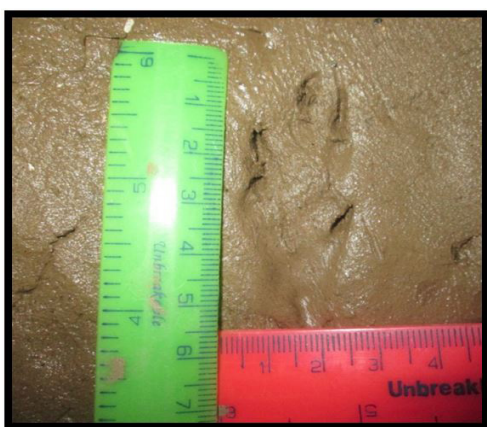
Figure 25: Pugmark of rabbit (fore foot)