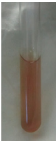
Figure 3: Cerebro-spinal Fluid of the patient.

The child's mother was registered and immunized for Tetanus Toxoid but not for Rubella Vaccine. She had no symptoms during her pregnancy (i.e., fever with rashes). The child was first birth order and was delivered normally. No history was suggestive of any perinatal infection.