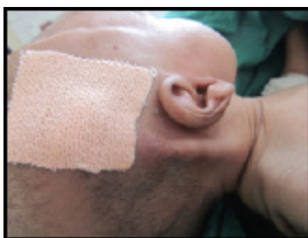
Figure 4: Chamber of Ventriculo-peritoneal Shunt.

Ventriculo-Peritoneal Shunt insertion has been done and the baby is on regular follow-up (Figure 4).