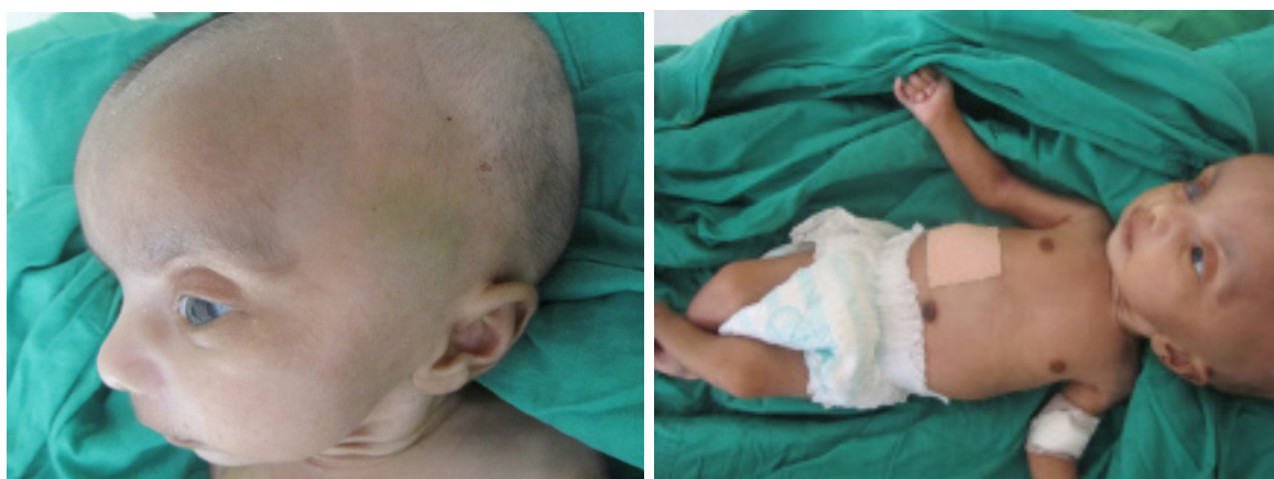
Figure 1: Clinical Photos of the patient.

Congenital Rubella Syndrome occurs due to in-utero infection of the fetus early in pregnancy by rubella virus. The virus has teratogenic properties and crosses the placenta and infects the fetus where it stops cells from developing or destroys them by direct involvement of viral replication in cell clones during first trimester of pregnancy. When infection occurs within first two months of pregnancy, there are 90% chances of fetal transmission leading to death or Congenital Rubella Syndrome which reduce to 80% in 8 to 12 weeks and 50% in 12 to 16 weeks. Deafness is most common in the latter period of gestation. Congenital anomalies with growth impairment are rare if infection occurs after 16 weeks of gestation. Hydrocephalus in a child suffering from CRS is rare and scarcely reported in the Literature. We report a case of hydrocephalus in a neonate of Congenital Rubella Syndrome (Figure 1).