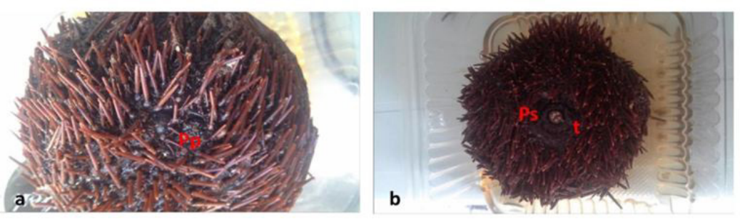
Figure 2: Sphaerechinus granularis found in the Bizerte lagoon. a) Aboral surface of S. granularis . The periproct (Pp) is located in the middle. b) Oral surface of S. granularis . Peristome (Ps), five teeth (t) of Aristotle's lantern

A specimen of S. granularis was found in the northern western coast of Bizerte lagoon at 5.5 m of depth (see position in Figure 1). The individual was found with a population of P. lividus on sediment composed by mud and sandy mud with fragments of mollusk shells. C. nodosa was the major marine plants encountered, although a few tufts of algae were also present, such as Caulerpa prolifera and Enteromorpha sp. The specimen has a purple and sub-spherical shape test, protected by a high density of robust and