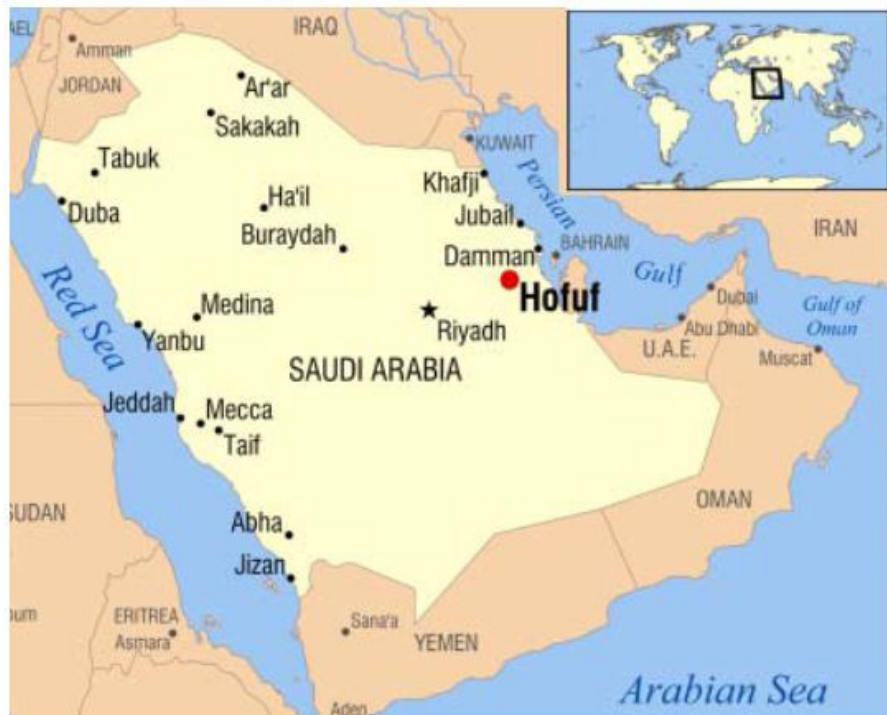
Figure 2: The main cities in Saudi Arabia Kingdom

waste production represents importance in the Kingdom because it requires a sustainable management to preserve human health, resources, environment and economy also, the new municipal solid waste management Law and Regulations contain many environmental, economic, social and health benefits as it is considered a source of raw materials, recycling methods and recovery for energy [34,35].