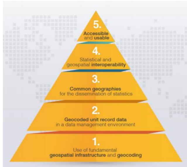
Figure 3: Principles of the Global Statistical Geospatial Framework [34]

ure 3) establishes the Global Statistical Geospatial Framework's guiding principles.