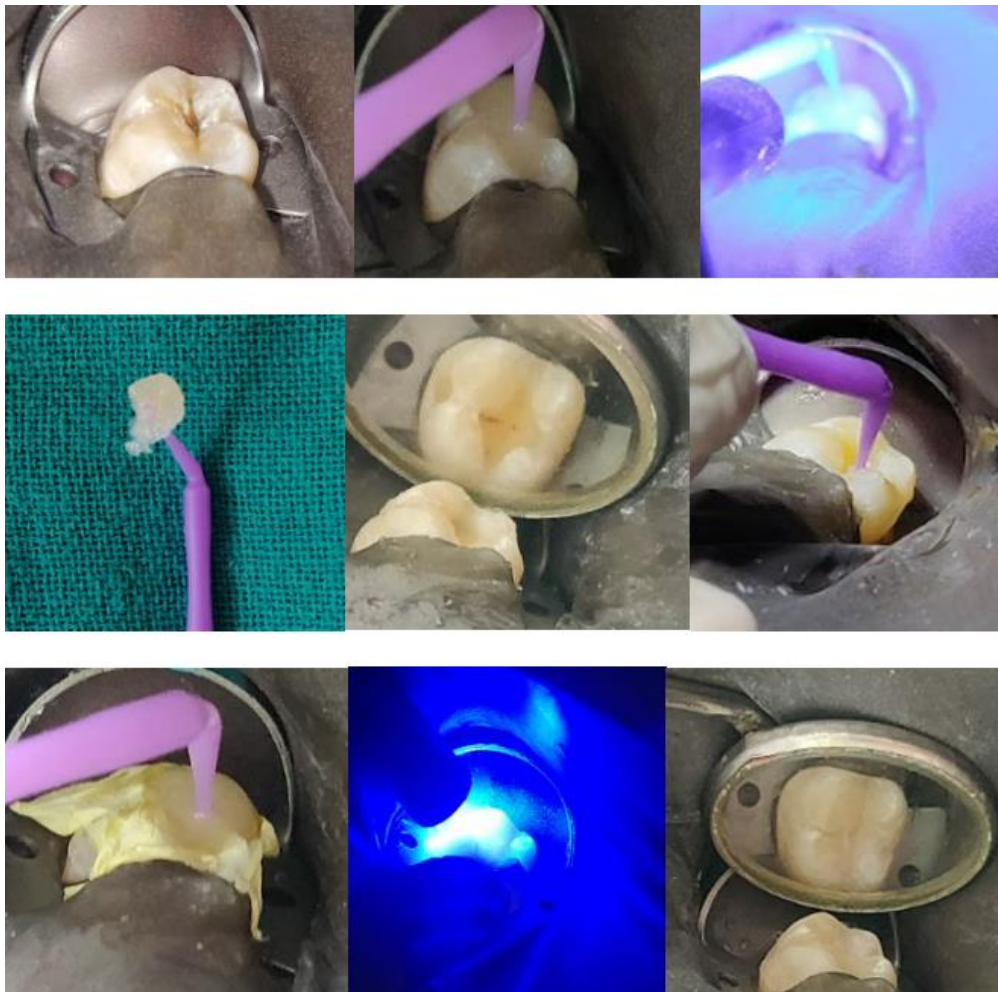
Figure 3: (a) Preoperative. (b) Making of stamp. (c) Curing of stamp. (d) Composite stamp (e)Cavity preparation. (f)Applying bonding agent (g) Placing of stamp on Teflon tape. (h) Curing. (i) After finishing and polishing