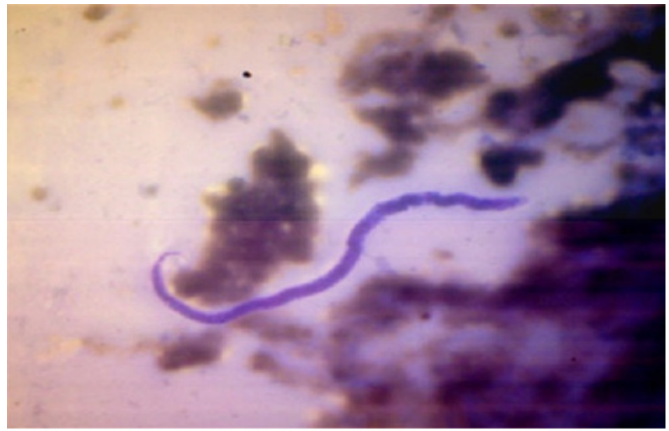
Figure1: Bone marrow aspirate showing microfilaria

Investigations showed hemoglobin 9 g%, total count 1200/µl differential count P40L40, MCV 77.3fl, platelet count 65000/µl. His liver, renal function tests, serum electrolytes, blood sugar were within normal limits. Initially a possibility of malaria was considered and patient was started on chloroquine and primaquine without any response as fever persisted. Peripheral smear for malaria parasites was repeatedly negative. Artesunate and Doxycycline was added considering falciparum malaria, but fever was persisting. Meanwhile his total count dropped to 700/µl and hemoglobin dropped to 6.5 g%. Suspecting underlying bone marrow failure, bone marrow aspirate was done which showed microfilaria (Figure -1,2) and the cellularity was decreased, reported as ? hypoplastic.