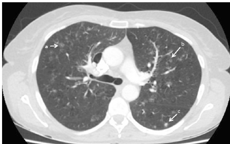
Figure 1: CT thorax demonstrating a number of ill-defined nodules including a) ground glass centrilobular nodules b) small nodules with tiny cavities and c) small ill-defined more solid nodules

The patient subsequently underwent a subtotal gastrectomy, for a perforated T4a tumour measuring 2.7cm in size with lymphovascular invasion, 6 of 27 nodes were involved. Adjuvant chemotherapy with 5-fluorouracil was initiated. She has not yet received any LCH targeted therapy but remains under respiratory surveillance.