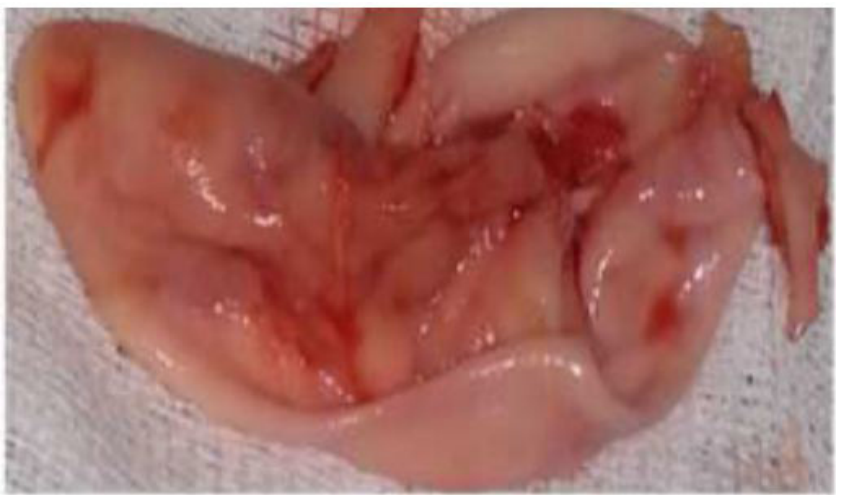
Figure 3: Macroscopic appearance of hydatid cyst after surgical excision