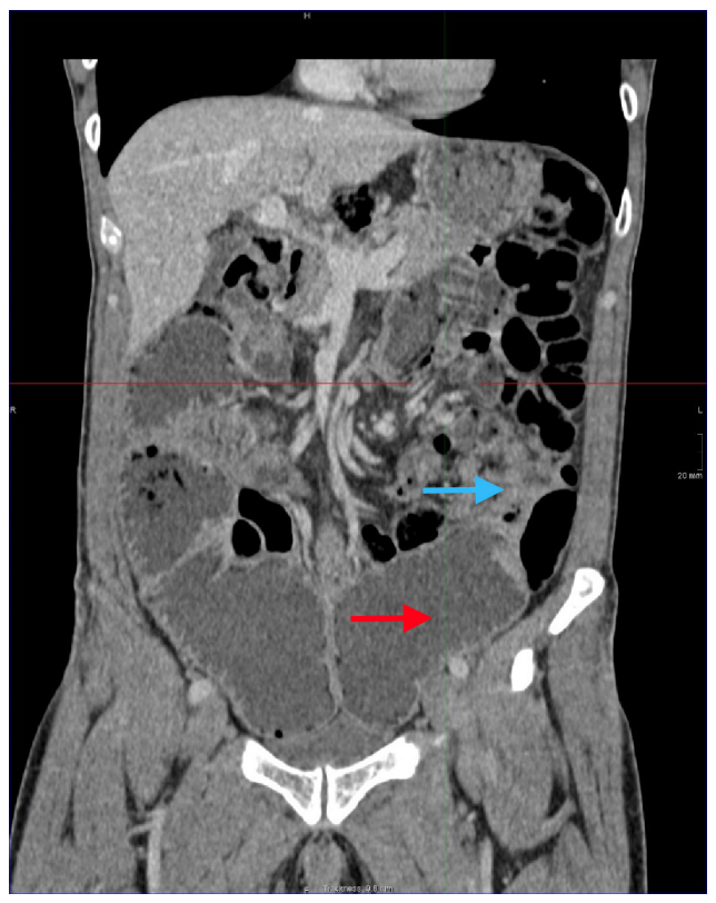
Figure 1: Computerised tomography showing obstructed jejunum (red arrow) and collapsed jejunum (blue arrow)