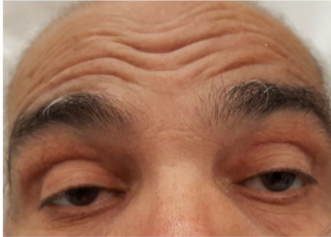
Figure 1: Bilateral ptosis interpreted as mark of cutis laxa. Note the frontalis muscle contraction