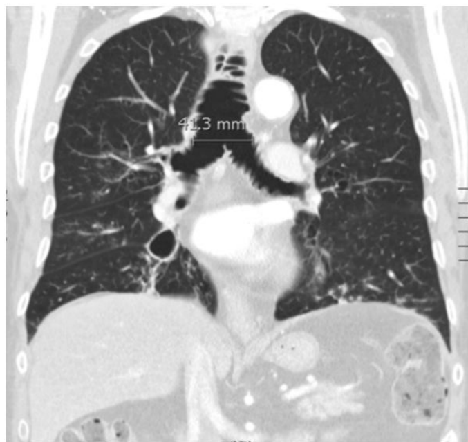
Figure 2: Computed tomography showing increased tracheal diameter (at coronal reconstruction)