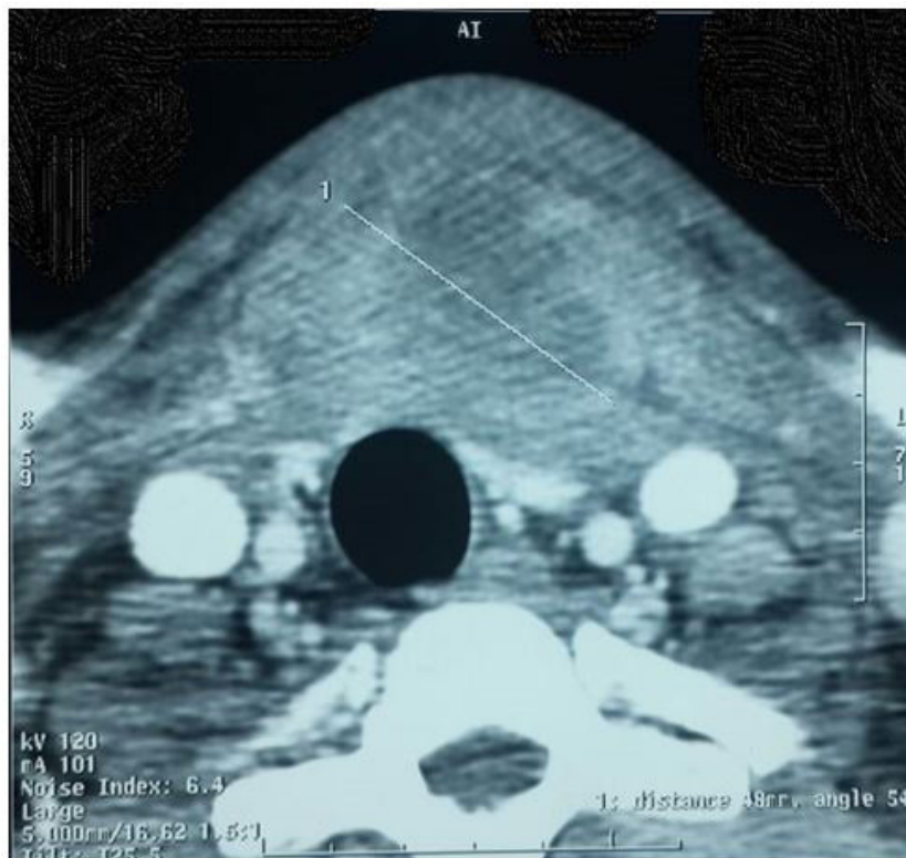
Figure 2: Aerobic and anaerobic cytobacteriological studies as well as Mycobacterium tuberculosis

Patient was put on anti-tuberculosis drugs for nine months, with a good clinical and biological evolution. The cervical swelling and mediastinitis regressed, and general state improved. On biology, white blood cells count and CRP were back to normal.