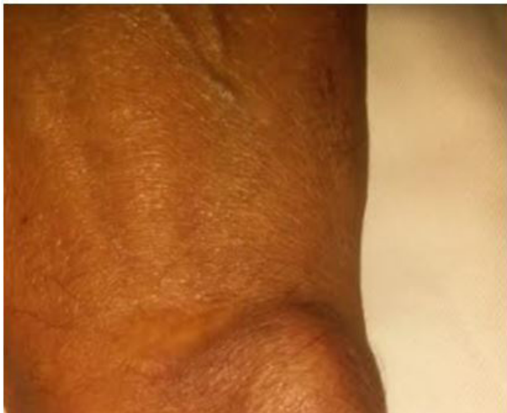
Figure 2: Hounsfield units for subtraction images for arterial phase minus baseline (AP), early portal-venous phase minus baseline (EPVP), late portal-venous phase (LPVP) and LPVP minus EPVP are given for liver tissue (left) and HCC (right). Whiskers of box-plots indicate 95% percentile, values outside are shown as dots. One-way ANOVA revealed significant group differences between all individual time points for HCC and liver tissue, respectively ( F = 197 , p < 0.0001 ), except for the comparison between liver tissue and HCC at LPVP ( p = 0.9 )

At early portal-venous enhancement minus baseline (EPVP), liver tissue attenuation reached 40.8 \pm 23.9 HU (range, 8 – 99 HU) while HCCs attenuation increased to 135.7 \pm 57.4 HU (range, 24– 252 HU). During late portal-venous phase minus baseline (LPVP), liver tissue enhanced to a mean of 81.7 \pm 28.5 HU (range 21 – 174 HU) and HCCs to 88.1 \pm 36.2 HU (range, 21-243 HU). In LPVP-EPVP subtraction maps, liver tissue showed HU values of 48.2 \pm 21.3 HU (range, 4 – 48 HU) and HCCs 3.5 \pm 12.2 HU (range, -34 – 84 HU, ANOVA F = 197 , p < 0.0001 ; Figure 2). All values showed significant differences, both between liver tissue and HCC at an individual time points during measurement, as well as compared to different time points with the exception of the comparison between liver tissue and HCC at LPVP ( p = 0.9 ).