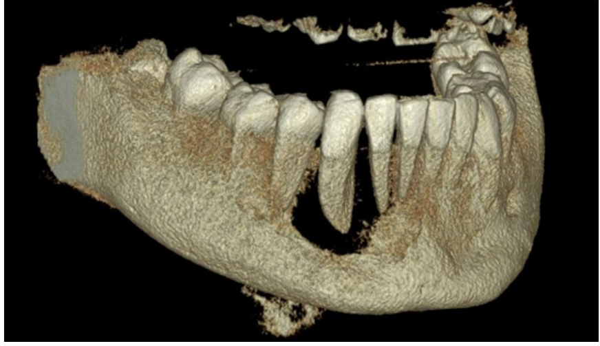
Figure 6: The round lesion had eroded the vestibular table around the canine in de 3D volume