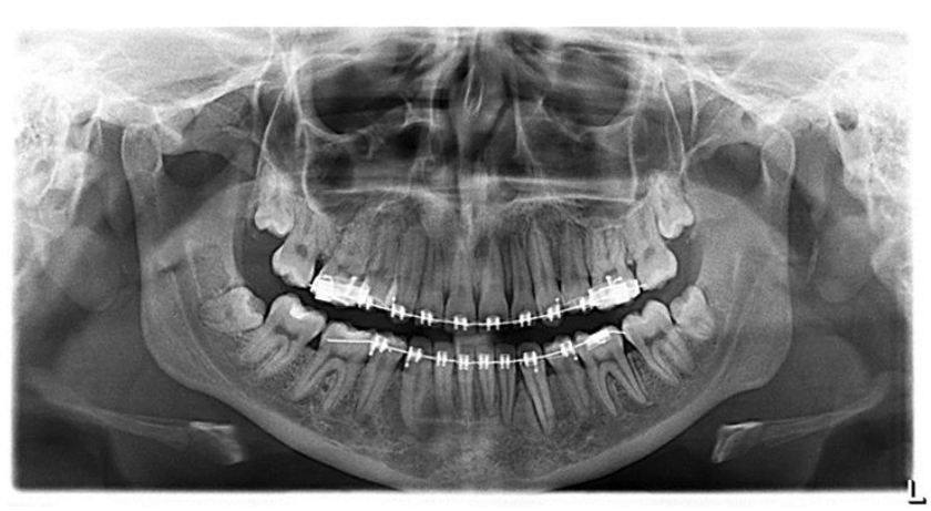
Figure 2: Panoramic Radiography at 18 years of age, without the first premolars, there is generalized widening periodontal space as a consequence of orthodontic dental displacement