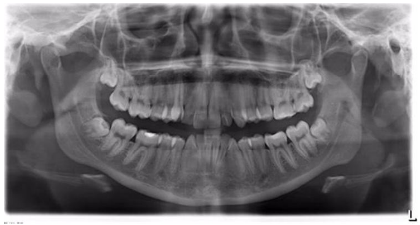
Figure 1: Panoramic radiography at 16 years-old, before the orthodontic treatment