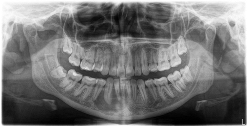
Figure 4: Digital panoramic radiography after two years removing orthodontic appliance, apical radiolucent lesion of rounded shape well-defined limits that extends from piece 4.5 to 4.1 that respects the bony cortices.