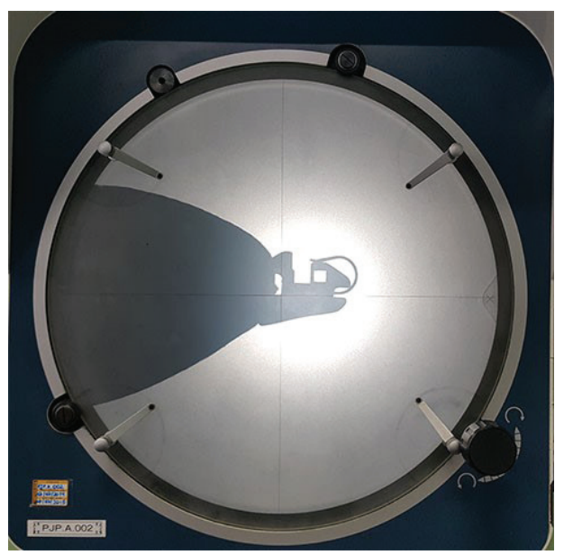
Figure 2: Bracket slot positioning and references axis lines, X (horizontal) and Y (vertical)

Brackets slot heights were measured using a Profile Projector [11] (Mitutoyo Profile Projector), PJ–A 3.000, Japan (Figure 1). The samples were, randomly, chosen and each bracket slot was positioned on an acrylic pedestal linked to a 90° arm, so that, all self-ligating system doors remained open during the measurements. The Profile Projector had two reference axis lines, horizontal (X) and vertical (Y) that guided and kept the correct alignment of the bracket slot while being assessed (Figure 2). So, after being positioned, the bracket slot image was projected and magnified (20 times) on the screen, thus slot height was gauged on the horizontal wall and then, recorded. The digital readout protractor facilitated the measurements. The same operator carried out the study evaluations and repeated after 45 days.