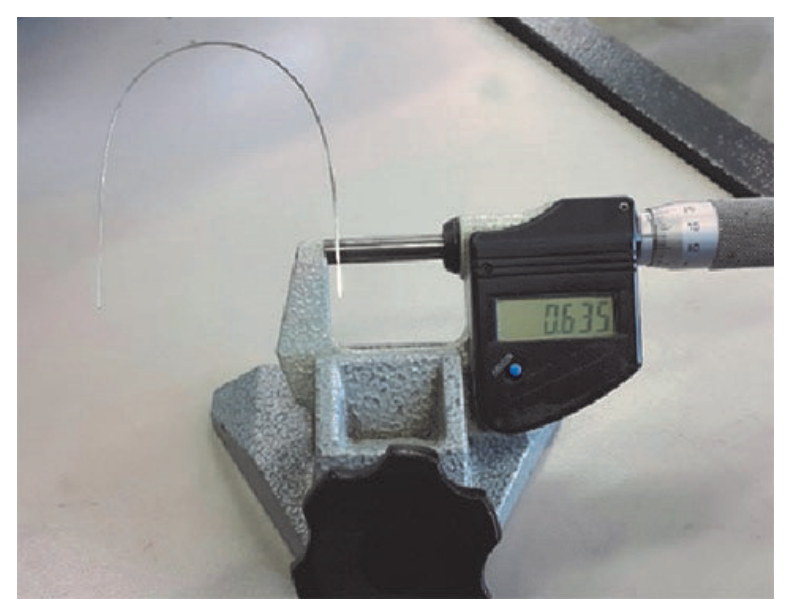
Figure 3: Digital micrometer

Ten arch wires of each manufacturer were cleaned (70% of alcohol), randomly selected, and the average of the terminal portion of each wire (the most reliable part), approximately 10 mm, was used for measurement purposes [1,6,17]. To test the height and width of the wires, a digital micrometer (0.001 mm, Mitutoyo, Japan) was used (Figure 3) and two operators measured the samples. The same procedure was repeated after 45 days, inter, intra-examiner reliability, reproducibility of the study and method error were analyzed.