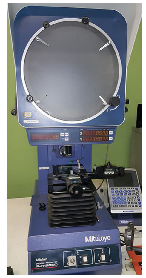
Figure 1: Profile Projector

*3M/Unitek, Monrovia, Ca/USA; GAC, York, Philadelphia, USA; American Orthodontics, Sheboygan, Wisconsin, USA; Forestadent, Pforzheim, Germany ** 3M/Unitek, Monrovia, CA/USA; Ortho Organizers, San Marcos, CA/USA; Morelli, Sorocaba, SP/Brazil; Abzil/3M, São José do Rio Preto/SP, Brazil Table 1: Brackets and archwires investigated in the Study