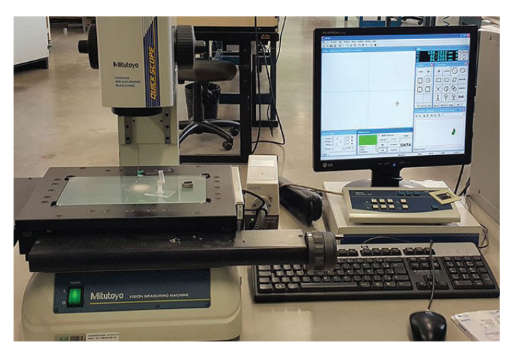
Figure 4: Vision-measuring machine