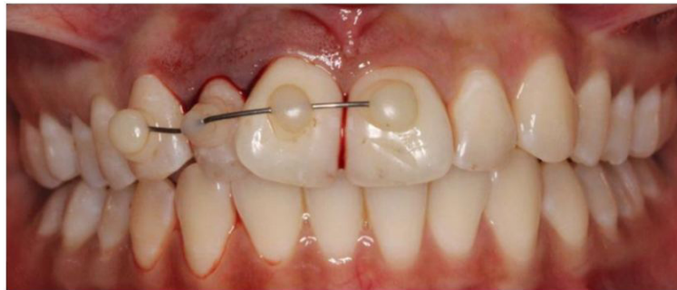
Figure 5: A clinical photograph indicating how displaced permanent teeth are repositioned back into their original place and splinted to allow healing of tissues