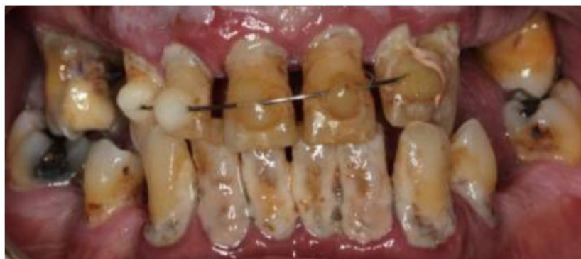
Figure 2: A clinical photograph to illustrate a mouth with poor oral hygiene, severe periodontal disease and multiple carious lesions.

Poor oral health: In a patient with poor oral hygiene, severe gum (periodontal) disease and multiple decayed (carious) teeth, avulsed teeth should not be re-implanted. Figure 2 illustrates such a neglected dentition. If in doubt, the tooth should be placed in milk and the patient directed to a dental professional. Other storage mediums such as Hank's Balanced Salt Solution and Hartmann's can be ideal storage media.