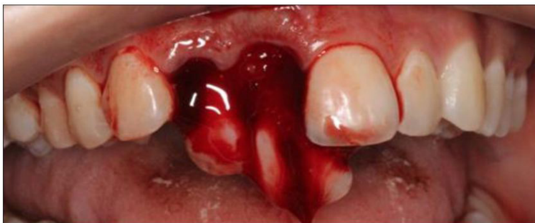
Figure 4: A clinical photograph illustrating a lateral luxation injury with an extrusive component of permanent central and lateral upper right lateral incisor teeth

Figure 4 illustrates a displacement injury (extrusion) of the permanent upper right central and lateral incisor teeth (UR1 & UR2 or 11 & 12). These teeth have been displaced towards the palate. If they are mobile, they may pose an airway risk and should be treated on an urgent basis. If patients present in an ED setting with Oral & Maxillofacial Surgery support, they can be called upon for further assistance. If this is not possible, then the patient should be directed to a dental professional. The treatment of loose, displaced teeth may include repositioning the displaced teeth under local anaesthetic and placing a wire splint to immobilise them as seen in Figure 5.