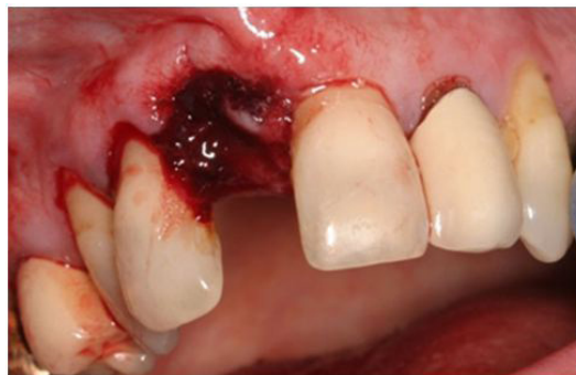
Figure 6: A clinical photograph illustrating an avulsion injury of the upper right central incisor tooth

Figure 6 demonstrates an avulsion injury where one tooth has been avulsed from its position. A video demonstrating a real case can be seen on the Dental Trauma UK website ( www.dentaltrauma.co.uk ). In such cases, the teeth should ideally be re-implanted immediately (within 5 minutes) as an emergency at the scene of the accident. If this is not possible, the avulsed tooth/teeth should be placed in a suitable storage medium (e.g. milk or Hartmann's solution) and the patient should go to their dentist as an emergency. In an Emergency Department setting, the ideal treatment would be to re-implant the tooth immediately without delay. The patient should then be referred to the Oral and Maxillofacial team to check the position of the injured or traumatised teeth and splint them. If re-implantation is not possible, then placing the avulsed tooth/teeth into Hartmann's solution until they can see a dentally qualified practitioner would be ideal. If there are any associated jaw fractures, the Oral and Maxillofacial team should be called to manage the patient. Figure 7 illustrates the ideal management of a patient with an avulsed tooth and this can be provided