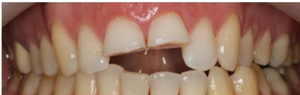
Figure 3: A clinical photograph illustrating complicated crown fractures of permanent upper central incisor teeth

Figure 3 shows a clinical photograph of a patient and their permanent dentition, suffering from a dental fracture injury. This type of injury can be treated on a delayed basis as the tooth is still in position and the injured tooth does not pose an airway risk. Eventual treatment may include nerve treatment and the use of tooth-coloured filling material. It might be prudent to ask the patient if they have the fragment and advise to keep it safe, or indeed enquire if they have any breathing difficulties to exclude the possibility of inhalation of the fragment.