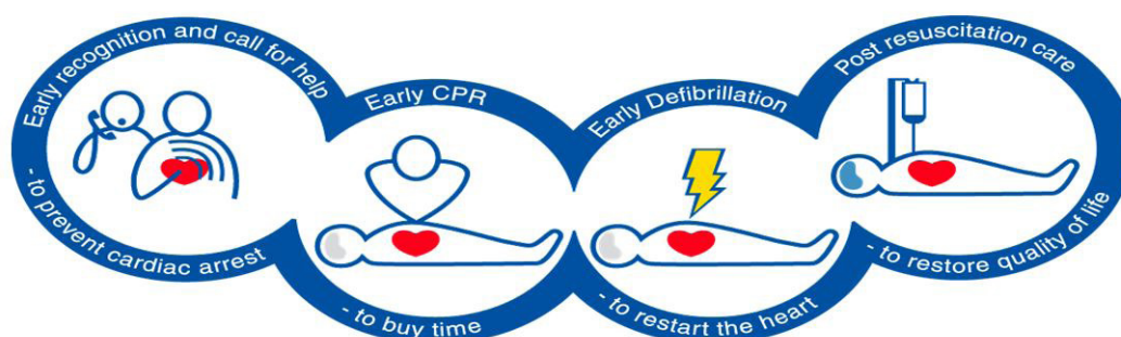
Figure 3: The Chain of Survival [3]