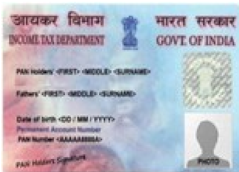
Figure 3: Permanent Account Number (PAN CARD) [14]

A permanent account number (PAN) is a ten-character alphanumeric identifier, issued in the form of a laminated "PAN card", by the Indian Income Tax Department, to any "person" who applies for it or to whom the department allots the number without an application [12]. In the year 1972, the concept of PAN was rolled out by the Indian government and was made statutory under section 139A of the Income Tax Act, 1961. Initially a voluntary process, PAN was made mandatory for all taxpaying individuals in 1976 [13]. (Figure 3)