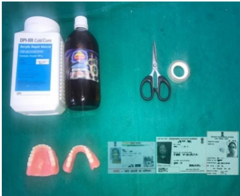
Figure 4: MATERIALS USED- DPI-RR Cold Cure Acrylic Rapid Repair, Scotch tape, Scissors, Denture Base, Identity proof.