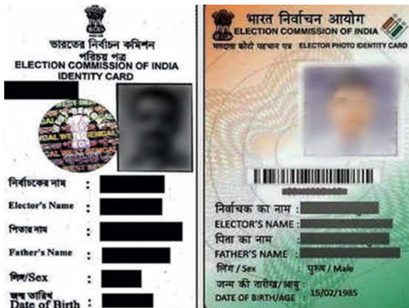
Figure 2: Voter Id Card Old(left) & New (Right), Issued by Election Commission of India [15]