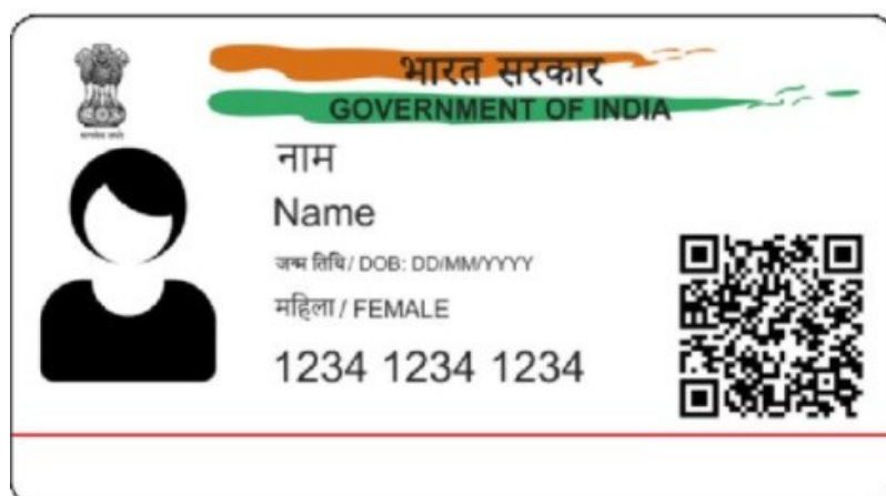
Figure 1: Aadhar Card [14]

The rationale and aim behind Government of India to introduce Aadhar Card was to provide an individual identity which would allow each person to avail social security benefits. Thus, allowing every individual to be will be financially inclusive and would also enable direct services delivery along with direct benefit transference. The government is able to communicate and govern its people using e-governance, preventing its people from identity fraud, ghost employee/voters and will in return reduce corruption [9]. It is thus rightly known as “Aam Aadmi ka Adhikar.” (Figure 1)