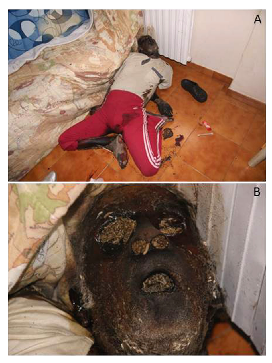
Figure 1: A. View of the room where the corpse was discovered B. Maggots at different life stage inside the natural orifices

investigations of the lungs showed widespread spill, areas with alveolar spaces occupied by eosinophilic edema, red blood cells and polymorph nuclear leucocytes, and areas of emphysema. The heart showed several areas of coagulative necrosis with myofibrillar suffering. The brain showed hydrophic hypoxic degeneration and the liver showed chronic active hepatitis.