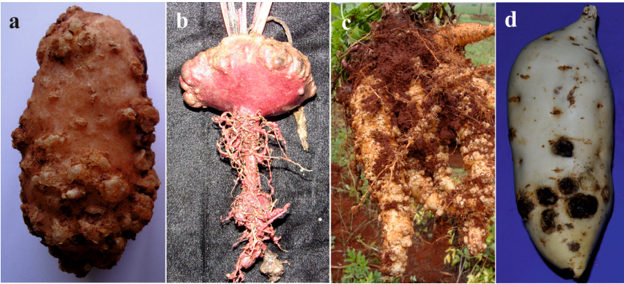
Figure 1: (a) Tuber symptoms caused by Meloidogyne spp . show a 'popcorn-like' structure in potato; (b) sugar beet; (c) Peruvian carrot, (d) and sweet potato