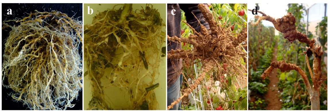
Figure 3: (a) Severe symptoms caused by Meloidogyne spp . infection in gilo roots; (b) cabbage roots; (c) pepper roots; (d) and melon roots

Among the fruits, important root-knot hosts include banana ( Musa spp. ), grapevine ( Vitis vinifera ), and papaya ( Carica papaya ), and infection may cause up to 33% and 50% losses in melon ( Cucumis melo ) and watermelon production, respectively [32]. A root-knot nematode species that has been recently highlighted in vegetable production is Meloidogyne enterolobii ( syn. M. mayaguensis ) (European 2014). The major problem in terms of M. enterolobii infection in horticulture has been their fast propagation and dissemination in the soil, with records all over the world. This root-knot species has a wide host range, being able to overcome the resistance of many horticultural products. In France and Switzerland, M. enterolobii was detected in 1983 as an important problem in tomato production areas [33]. In Northeast Brazil, M. enterolobii was described in 2001 in guava production areas and later as infecting green pepper rootstock and cucumber in other areas [34]. Its presence was also reported in jalapeño pepper and watermelon in Mexico [35]. Other economically important M. enterolobii hosts are aubergine, bean, sweet potato, and ornamental plants, such as Brugmansia and Clerodendron .