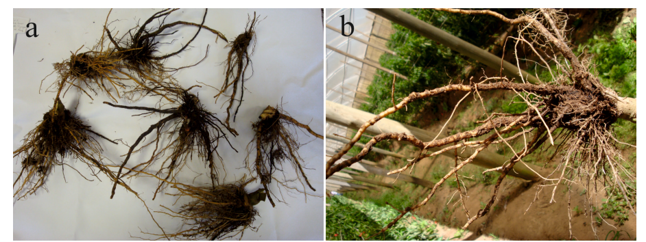
Figure 4: (a) Necrosis Symptoms in Pepper Roots caused by pratylenchus spp . Lesion Nematode Infection in capsicum annuum (b) and capsicum baccatum

Reproduction in members of the Pratylenchus genus may be sexual or asexual depending on the species. Pratylenchus neglectus, P. thornei and P. brachyurus reproduce by parthenogenesis, while male and female P. penetrans must mate before producing fertile eggs. Pratylenchus females lay an average of one egg per day, and, at appropriate temperatures, the cycles range from 45 to 65 days [39,40]. Once juveniles emerge from the eggs, approximately one week after egg deposition, all stages are capable of infecting and feeding from plant roots. Lesion nematode damage in plant roots is generally evidenced by necrosis and death, as exemplified in pepper (Figure 4).