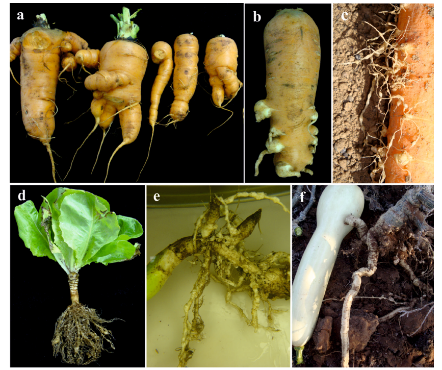
Figure 2: (a) Symptoms caused by Meloidogyne spp. infection in carrots show bifurcation and protuberances; (b) evident gall formation; (c) and galls in carrot secondary roots; (d) galls in lettuce roots; (e) galls in okra roots; (f) and big galls pumpkin roots.

Other important cultures affected by Meloidogyne infection are gilo, cabbage, pepper and melon, all presenting evident gall formation, affecting their development and production (Figure 3). Moreover, the damage caused to the roots and tubers (galls and injuries) are generally very compromising in terms of plant development [31]. Some cultures that are more uncommonly parasitized by other nematode species but are good hosts to Meloidogyne nematodes are bell pepper ( Capsicum annuum ), black pepper ( Piper nigrum ), garlic ( Allium sativum ), and onion ( Allium cepa ).