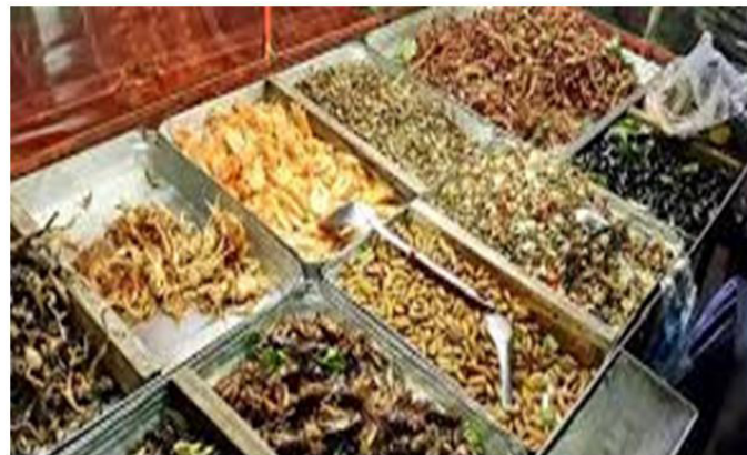
Figure 2: Sale of insects in an Asian market

In American countries like Mexico there is already a general entomophagic. Consumption of insects is common, with more than 57 different species eaten both as larvae and as adults, usually roasted. Consumption of insects is usually seasonal. They are marketed in both small and large markets. The most consumed species are three: a cockroach ( Periplaneta australassiae Fabricius ), and two moths ( Latebraria amphipyroides Guenée and Arsenura amida Cramer ) [8]. Grasshoppers are a specialty of Mexican gastronomy; they are usually eaten marinated in lemon juice. In Colombia consumption of the culona ant is traditional.