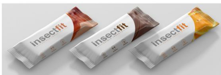
Figure 3: New products based on insects