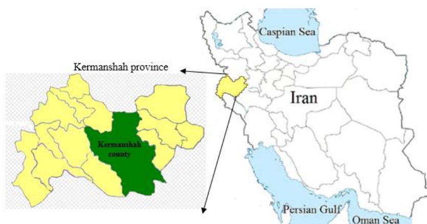
Figure 2: Study site

A cross-sectional survey was applied for studying farmers' safety behavior in the use of tractors. Target group was a community of 720 tractor-owner farmers in Kermanshah, a county of Kermanshah province in western Iran. (Figure 2). 250 farmers were selected using stratified random sampling technique.