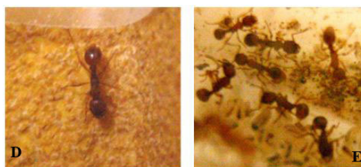
Figure 1: Some views of the experiments. D: an ant under aluminum diet moving frankly on a rough, uncomfortable substrate. E: ants under aluminum diet taking care of their brood inside the nest.

Ants of colonies A and B set their brood far from their nest entrance, at an inaccessible place inside the nest. The usual protocol allowing studying the ants' care of brood could no longer be used (removing larvae from the nest and assessing the ants' relocation of them inside the nest) and a novel one was set up. Before the ants consumed aluminum, then after they had consumed that product for 7 days, we observed the brood of each colony, together with the ants located on and in the vicinity of the brood (Figure 1E). During each observation, we recorded over 15 minutes, at the end of each minute, the number of ants present on and very near the brood (= 'p'), as well as the number of ants interacting with the brood (= 'i'), i.e., licking, moving, relocating a larva, regurgitating food. For each kind of diet, the 15 'p' numbers as well as the 15 'i' numbers recorded for each colony were added and the mean proportion of 'p/i' was calculated (Table 3, line 1). The numbers 'p' and 'i' obtained for ants under aluminum diet were compared to the corresponding numbers previously obtained for ants under normal diet using the non-parametric \chi^2 test for 2×2 contingency tables [51].