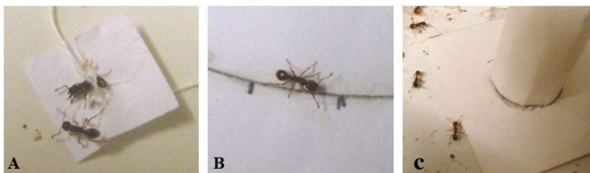
Figure 1: Some views of the experiments. A: an ant under normal diet having reached a tied nestmate which emits its alarm pheromone. B: an ant under aluminum diet following for a time a circular trail. C: three ants under aluminum diet not inclined in coming onto an unknown and risky apparatus

The method has already been used in several previous works [46,47,49]. A tower standing on a platform, both being made of strong white paper (Steinbach®, height=4 cm; diameter=1.5 cm), was set in the ants' tray, and the ants present at any place of this unknown apparatus were counted 12 times over 12 min (Figure 1C). The mean and the extremes of the obtained values were established (Table 2). The values obtained for the two colonies as well as those obtained during each successive time period of two minutes were pulled and the results for ants under aluminum and normal diets were compared using the Wilcoxon test.