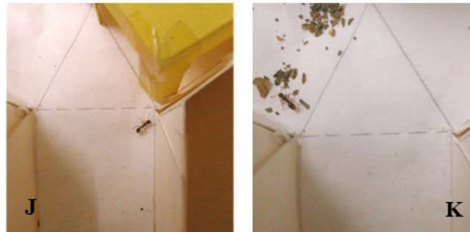
Figure 1: Some views of the experiments. J: an ant under aluminum diet, trained to a hollow yellow cube, hesitating to give to correct response when tested in a Y apparatus provided with that cue. K: an ant under aluminum diet, trained to basilica, giving the correct response when tested in a Y apparatus provided with that cue

as above]. The Y-apparatus was provided with a yellow hollow cube or pieces of basilica in one branch. Half of the tests were conducted with the cue in the left branch and the other half with the cue in the right branch. Moving into the branch containing the cue was considered as giving the correct response (Figure 1J, K). For each test, 10 ants of each colony were tested, the numbers of ants under aluminum diet being thus 10 ants×2 colonies=20 ants, and of ants under normal diet, n=10. The percentage of correct responses was established for each test (Table 4). The results obtained for ants under one and the other diet were compared thanks to the non-parametric Wilcoxon test.