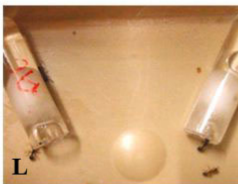
Figure 1: Some views of the experiments. L: ants under aluminum diet not preferentially choosing sugar water containing this metal (tube with the red label 'al') when confronted to it and to aluminum-free sugar water (tube with no label)

After the ants lived under an aluminum diet during 12 days, we conducted an experiment in order to reveal if they became dependent on that product. The protocol of this experiment was identical to that used for examining potential ants' addiction to different substances [46,47,49]. For colony A and for colony B, 15 ants were removed and set in a small tray (15cm×7cm×5cm) in which two tubes (h=2.5cm, diam.=0.5cm) had been deposited, one containing sugar water, the other containing a sugar solution of aluminum i.e., the solution used throughout the hole study (Figure 1L). In one tray, the tube containing aluminum was deposited on the right, and in the other tray, it was deposited on the left. After that, the ants seen drinking each liquid were counted 15 times over 15 min. The two sums of these two different counts were compared to those which should have been obtained if ants randomly went drinking each kind of provided liquid, using the non-parametric goodness of fit \chi^2 test [51]. On the basis of these two sums, we also established the proportion of ants which have chosen each kind of liquid.