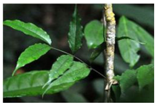
Figure 1: Photo of Gnetum africanum

Nowadays no studies have shown the incidence of GnA consumption on dyslipidemia in diabetic subjects. The aim of this study is to show whether chronic consumption of Gnetum africanum could prevent dyslipidemia in diabetic rat. On the one hand, it will be necessary to evaluate the content of phenolic compounds and the antioxidant activities of the plant. Subsequently demonstrate the anti-hyperglycaemic capacity of the plant and assess the impact on plasma lipid concentration in diabetic rats.