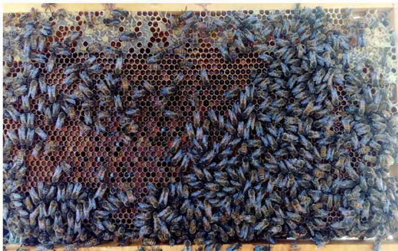
Figure 1: Bees and Queens Collection

This experiment was conducted at Hatay Mustafa Kemal University (HMKU), Hatay, Turkey, between May and August 2019. All bees and queens were collected from honey bees ( Apis mellifera anatoliaca ) reared at HMKU (Figure 1). Drones were collected (16 d or older) from