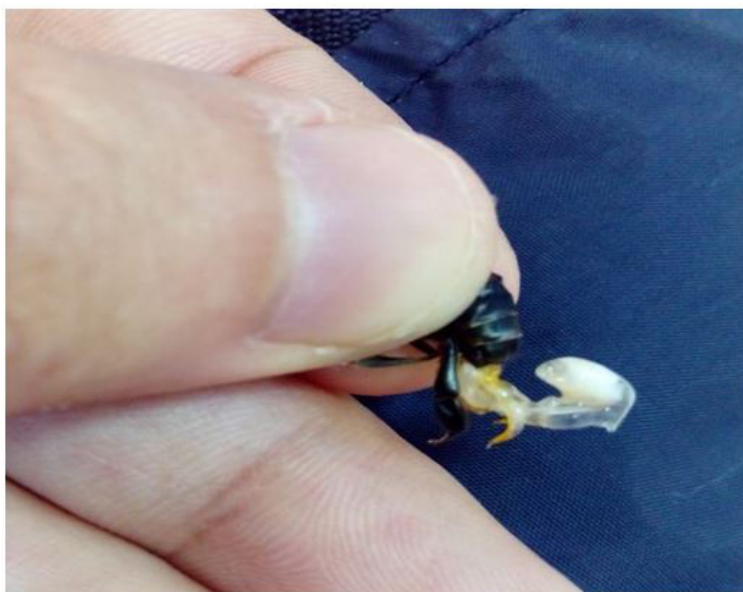
Figure 2: Semen Collection for Artificial Insemination in Honey Bees

The experiments were designed to compare different amounts of (25mM, 50 mM and 100mM) proline, cysteine and L-glutamine amino acids and control II group without addition on cryopreservation of honey bee semen based on sperm motility, viability, intact membrane and fertility rates. Therefore, bee semen was collected using standard methods as described above (Figure 2). Basic saline solution was loaded into the syringe tip for semen collection by Schley artificial insemination instrument. Fresh semen in the study was held as a control I in the study. Ten cryopreserved study groups were either Control II with no supplement, 25mM, 50mM and 100mM proline, 25mM, 50mM and 100mM cysteine, or 25mM, 50mM, and 100mM glutamine groups, respectively.